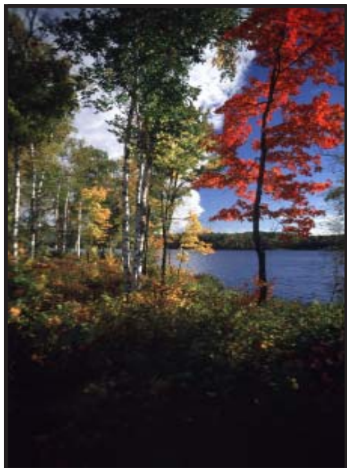
Beautiful scenery in Biwabik, Minnesota

outdoor activities across the country. In response to the increasing popularity of off-road recreation, public land managers have recognized the need to provide areas where individuals can take part in this sport safely and legally.