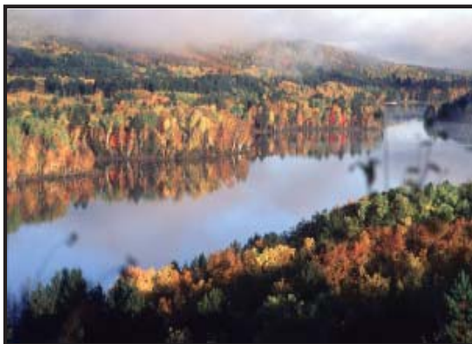
Blazing reds, yellows, and oranges reflect the cool, crisp blue waters of northern Minnesota and create a spectacular fall landscape near Biwabik, Minnesota.